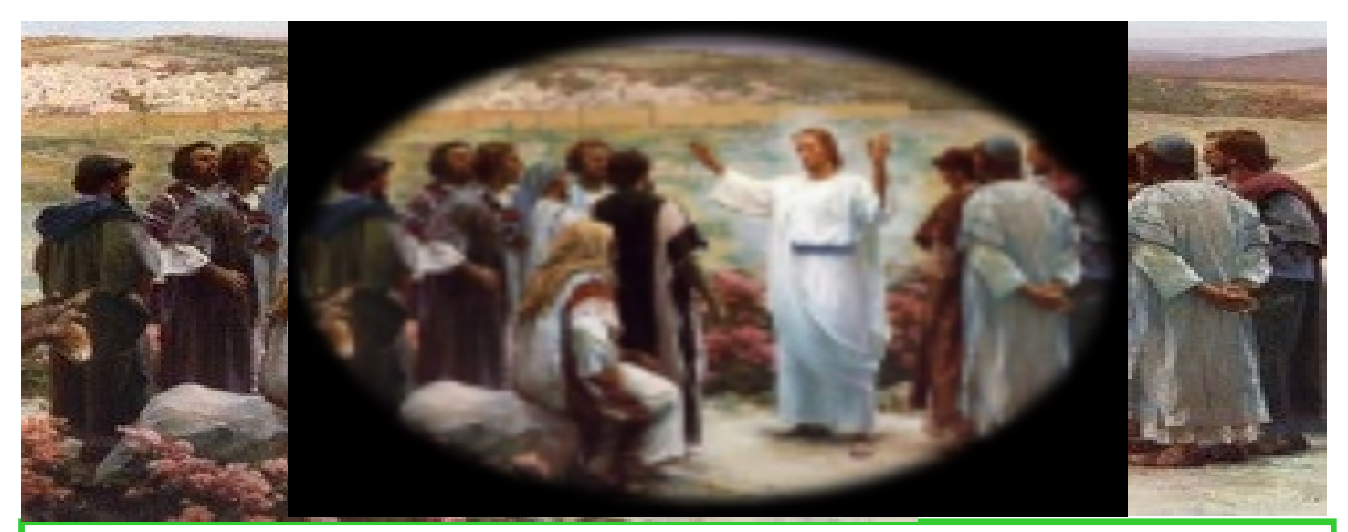
Sunday 26 August - 21st Sunday in Ordinary Time